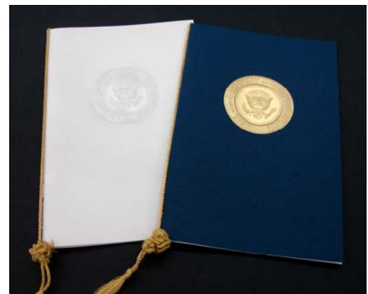
Service Programs from President Reagan's Funeral

We have assembled these keepsakes in a museum quality presentation with captions depicting the various items and events. Thus far, the response has been outstanding. The collection is appreciated for its historical content and significance, as well as its patriotism. We believe it will be of interest to future generations of visitors to come. We have been encouraged to collect memorabilia from other presidential funerals as well. We are currently procuring items from President Lincoln and President Eisenhower (a fellow native Kansan).