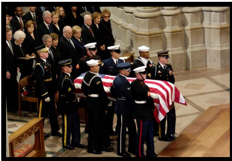
President Ford's Funeral Service at the Washington National Cathedral

We can also remember how our nation has paid honor and tribute to our past U.S. Presidents at their state funerals. While these funerals were certainly full of pomp and circumstance, they provided a way for ordinary citizens to